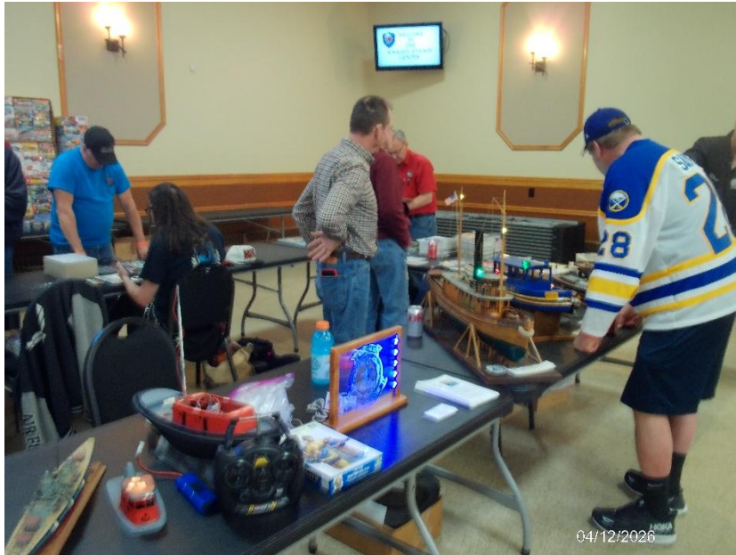
Our table at the IPMS Buffalo Niagara Frontier Model Show 4/12/2026