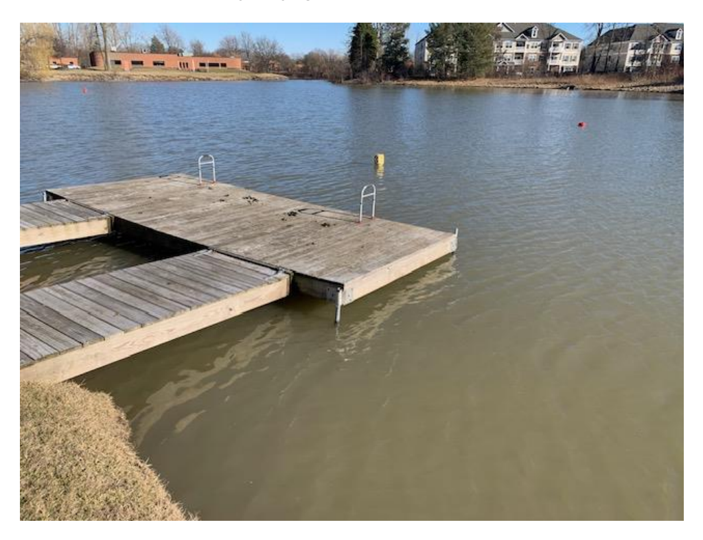
Dock and buoys