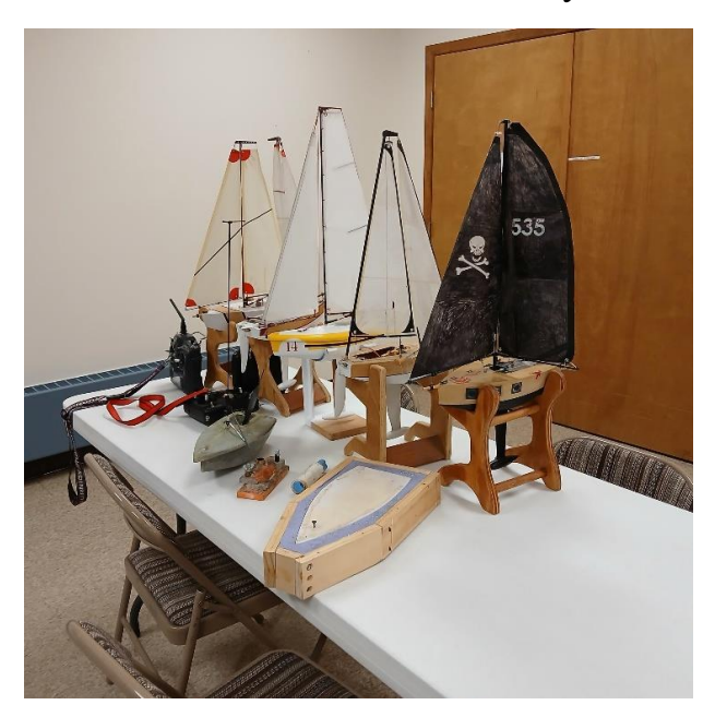
Mark's footy Collection