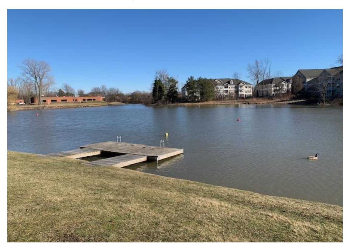
Open Water once More - Brian Mau