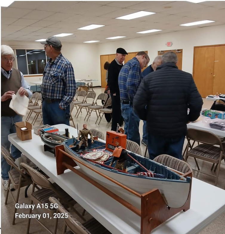
Galaxy A15 5G February 01, 2025