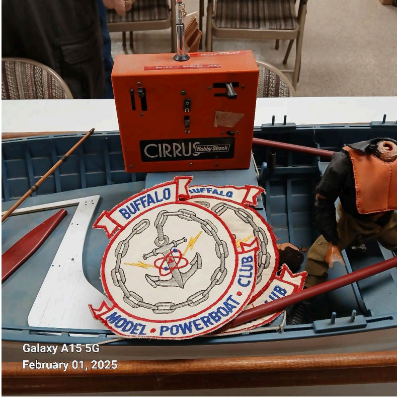
Galaxy A15 5G February 01, 2025